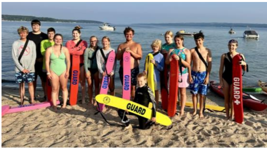
Lake Swim participants from Swim School