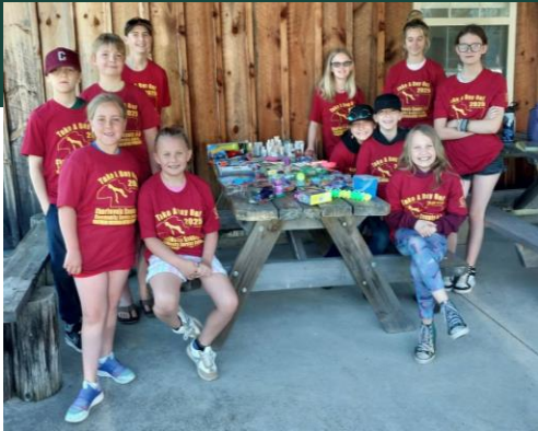
Take A Day On at the Antique Flywheelers