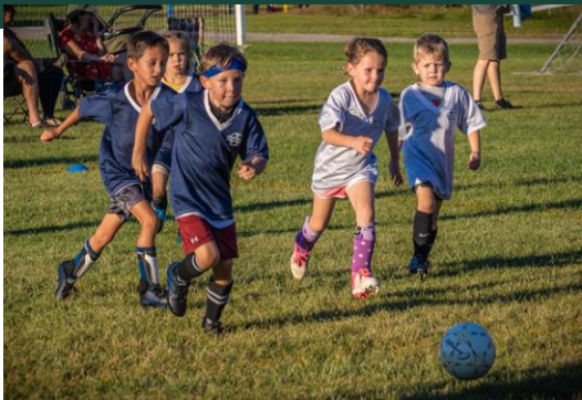
Boyne Area 4-H Fall Soccer