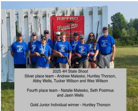
2025 Shooting Sports Team at State Finales